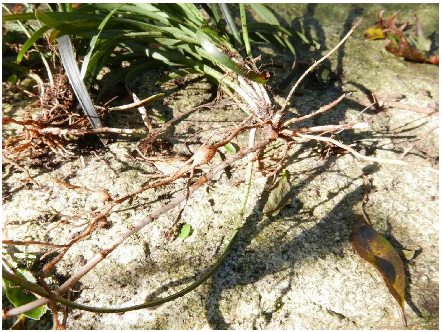
Along the Ophiopogon planiscapus 'Nigrescens' roots I found swollen sections and wondered if, as with a number of other plants, these are stores of nitrogen which could benefit other plants.