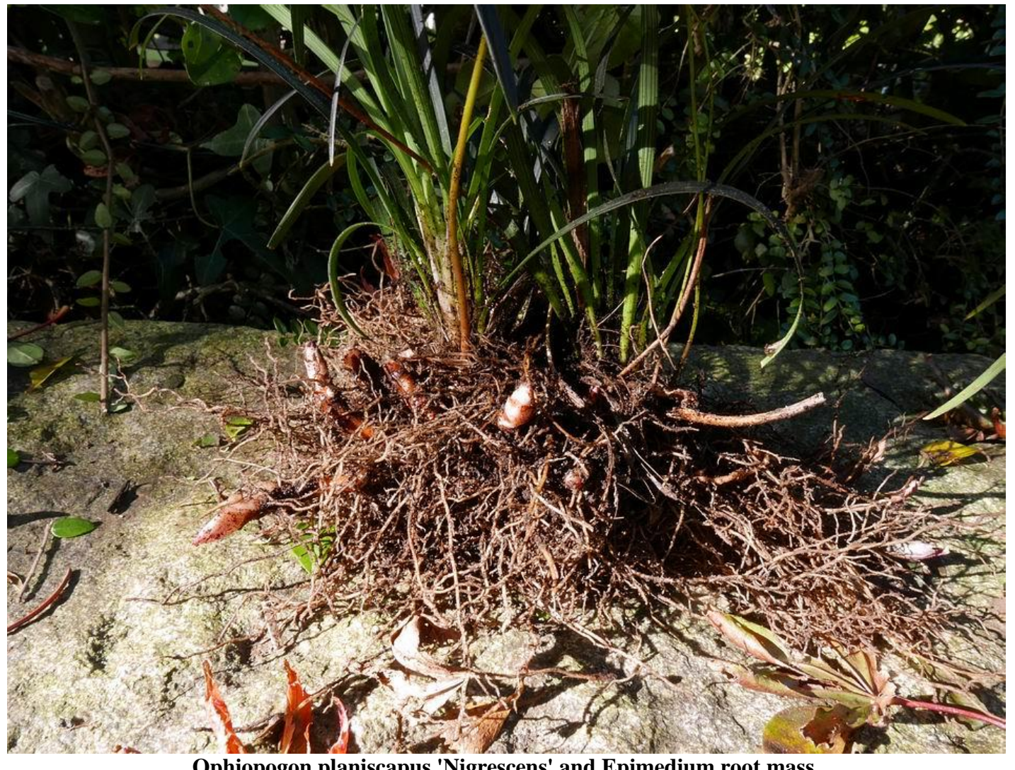
Ophiopogon planiscapus 'Nigrescens' and Epimedium root mass.

Over the years I have observed and assessed which plants make good companions and which are too aggressive and liable to swamp smaller less vigorous subjects and many Epimediums fall into the latter category. When an Epimedium seeded into the edge of this bed I was happy to allow it to stay however in recent years it has been spreading too far and its aggressive roots were encroaching on the nearby Trilliums so I have decided to remove it. I carefully separated the Ophiopogon planiscapus 'Nigrescens' roots which were intertwined with the Epimedium. The Ophiopogon also has a spreading nature but it does not seem to choke the life out of the bulbs which grow happily through its attractive black leaves.