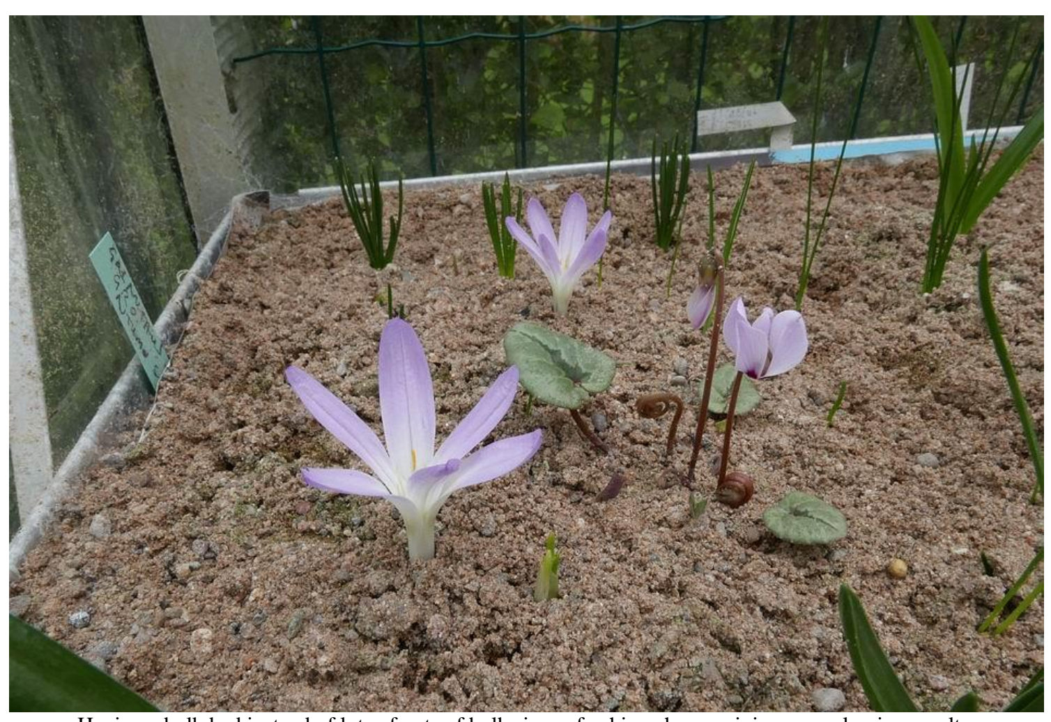
Having a bulb bed instead of lots of pots of bulbs is a refreshing change giving very pleasing results.