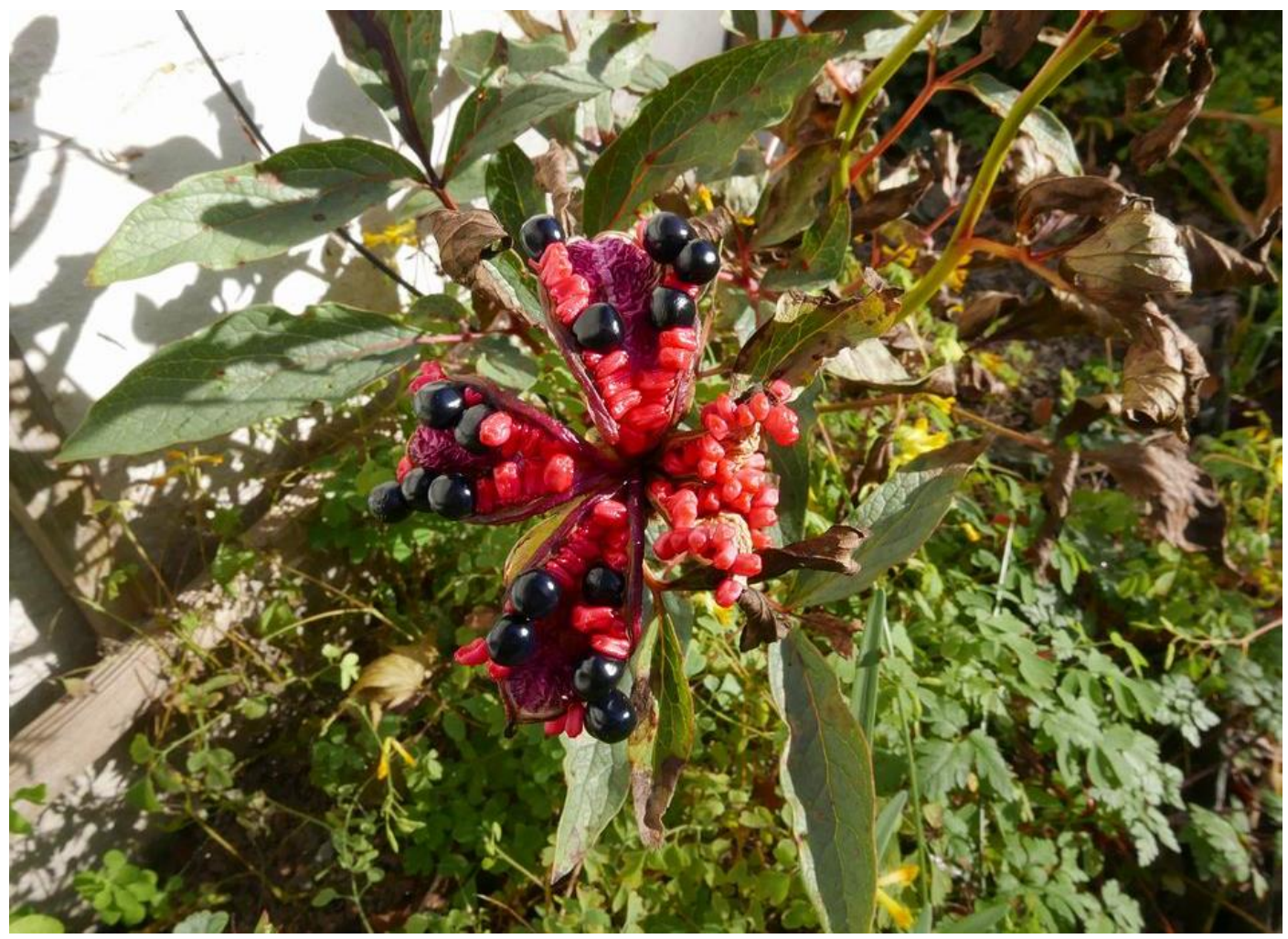
One of nature's countless beauties are Paeonia cambessedesii seed heads where the plump dark fertile seeds contrast so dramatically with the shrivelled unfertilised red ones.

image down to almost nothing, I have recorded even more. After I made the still life I tipped the plant material onto newspaper in the glasshouse - two days later it still looks fresh and the colchicums are still opening and closing.