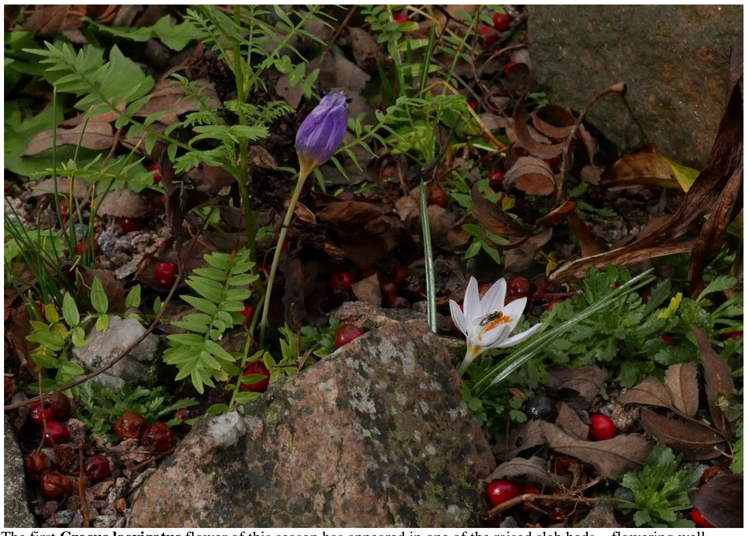
The first Crocus laevigatus flower of this season has appeared in one of the raised slab beds – flowering well ahead of those in the bulb houses.