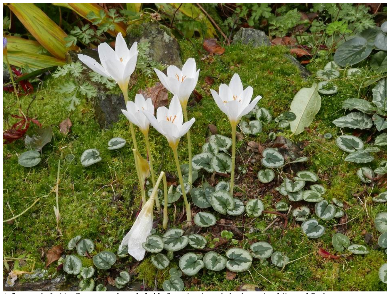
A fine stand of white Crocus speciosus hybrids flowering through the decorative foliage of Cyclamen coum.