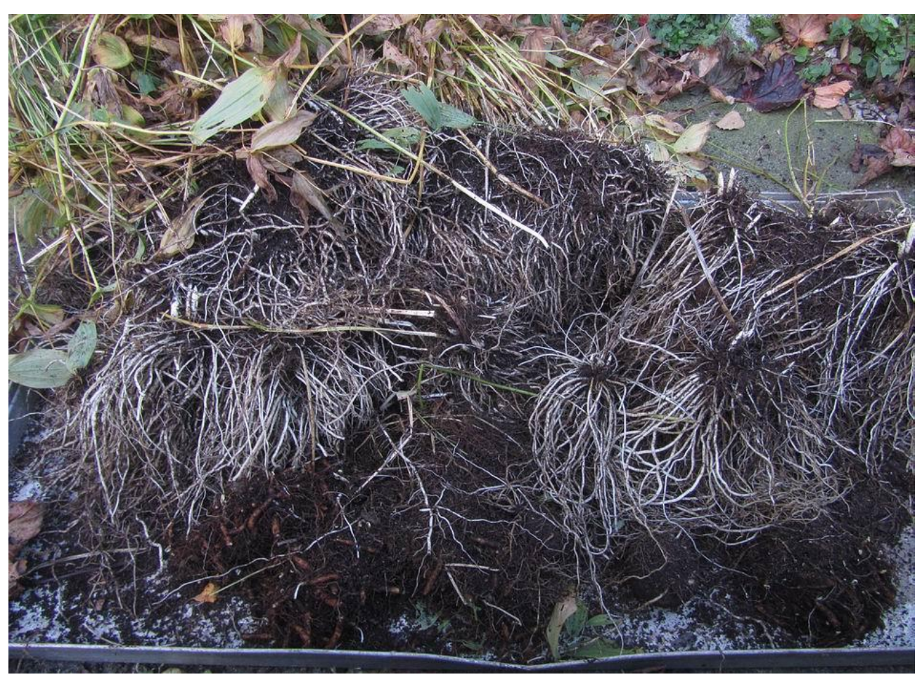
Uvularia comes into growth some time after the early bulbous plants in this bed have put on their colourful display, making it generally a good companion; however as it spreads it can swamp some of the smaller plants robbing them of light, water and nutrients. I should point out that