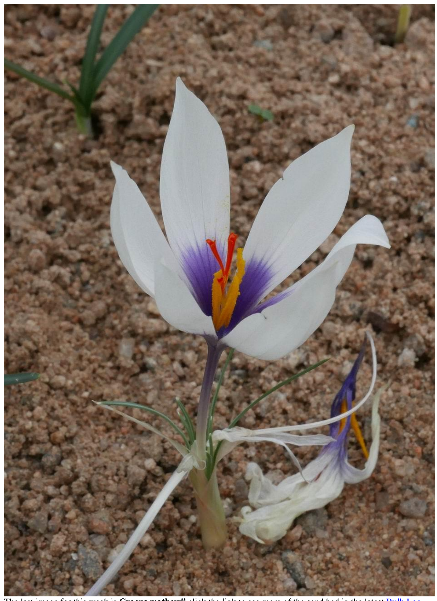
The last image for this week is Crocus mathewii click the link to see more of the sand bed in the latest <u>Bulb Log Video Diary Supplement</u>.....