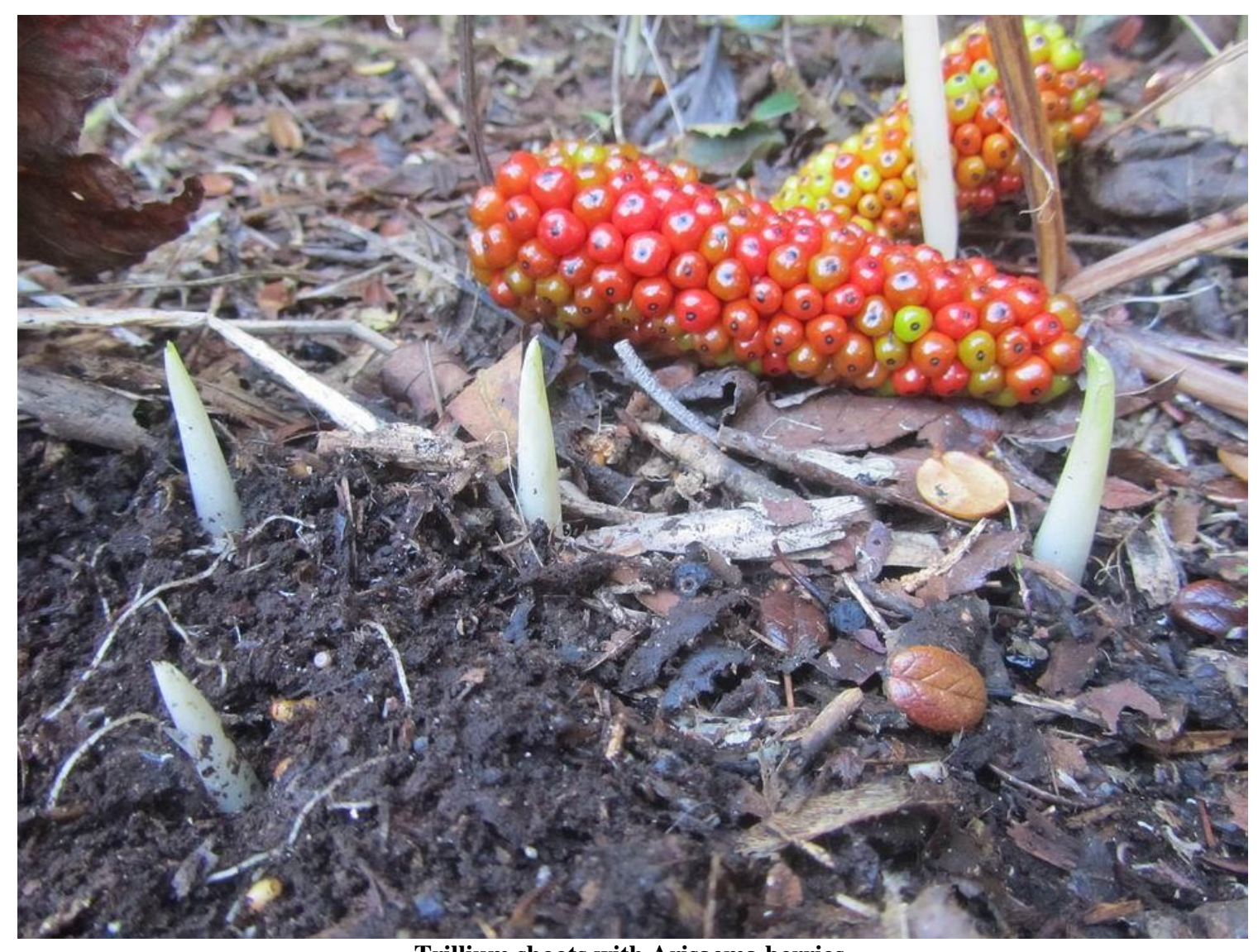
Trillium shoots with Arisaema berries.

Before I start getting in and digging around the clump of Uvularia I need to check where I will be standing to make sure I will not damage any shoots. Sure enough right at the edge where I would have placed my feet is a group of Trillium shoots about to be swamped by the expanding Uvularia.