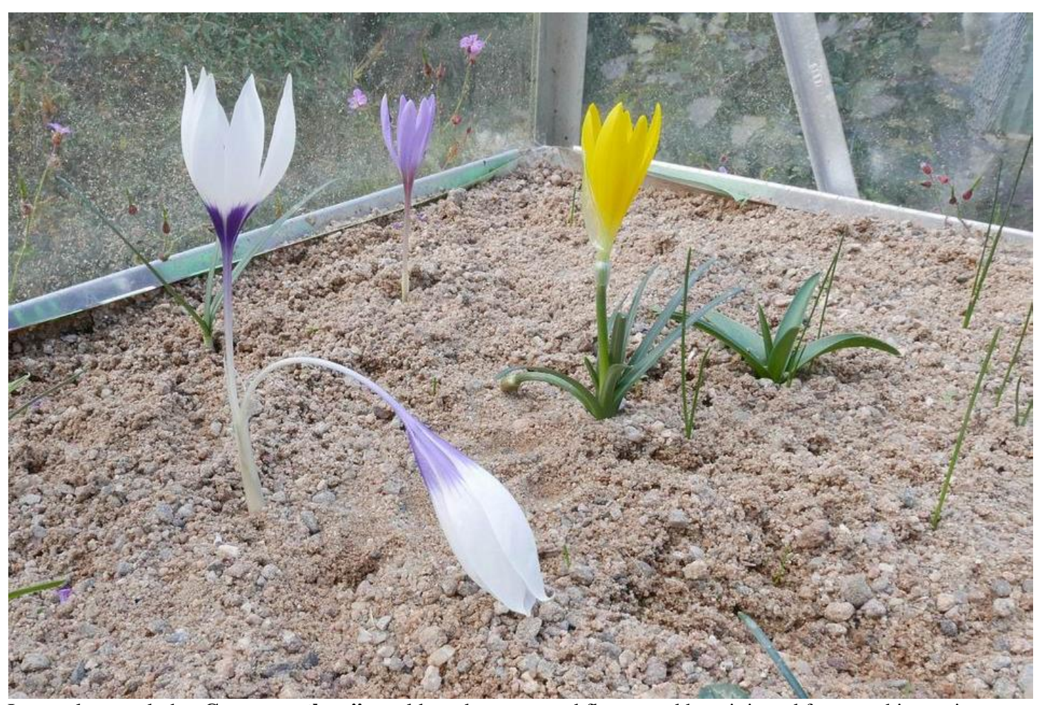
I wrote last week that Crocus mathewii would send up a second flower and here it is and for now this one is managing to stay upright