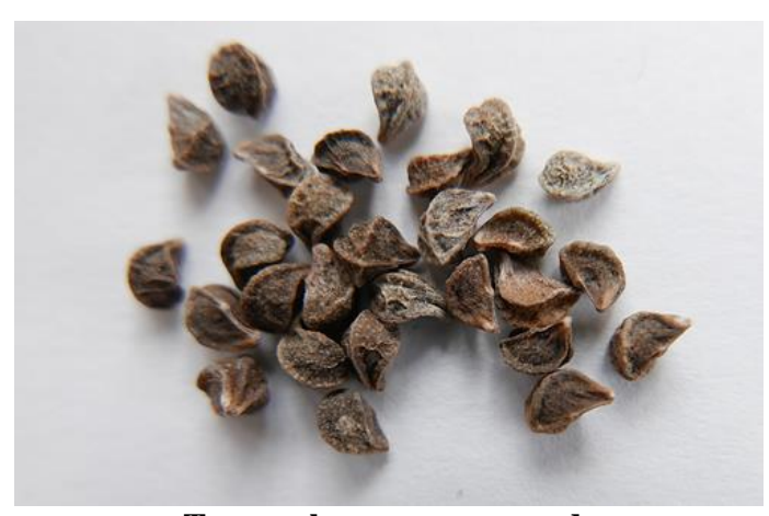
Tropaeolum azureum seeds

In other sandbeds I have a mixture of both Tropaeolum azureum and Tropaeolum tricolor but in this bed I wanted to keep only Tropaeolum azureum so I sowed seeds quite deep in the sand around a month or six weeks ago and now a number of them are germinating. While the growth will be able to climb and mix with the Tropaeolum tricolor from the adjacent sand bed giving that fabulous mix of colours, the tubers will be in separate beds.