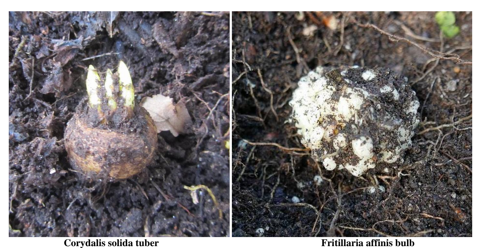
I rescued Corydalis solida tubers and bulbs of a yellow form of Fritillaria affinis from the Epimedium roots. This Corydalis tuber has three shoots which means that it will produce three flowering stems and at the base of each a new tuber will form. As I was handling the Fritillaria bulb I dislodged many of the rice grains each of which will, if conditions are favourable, grow on and in around three years will form a flowering bulb.