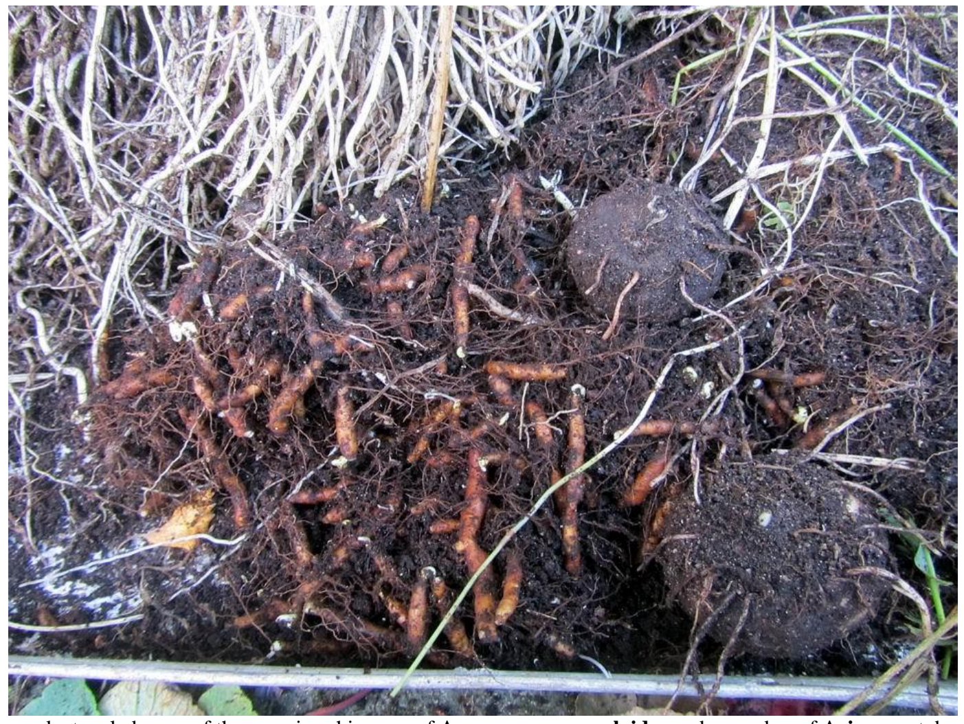
I rescued a tangled mass of the creeping rhizomes of Anemone ranunculoides and a number of Arisaema tubers from the Uvularia root mass.