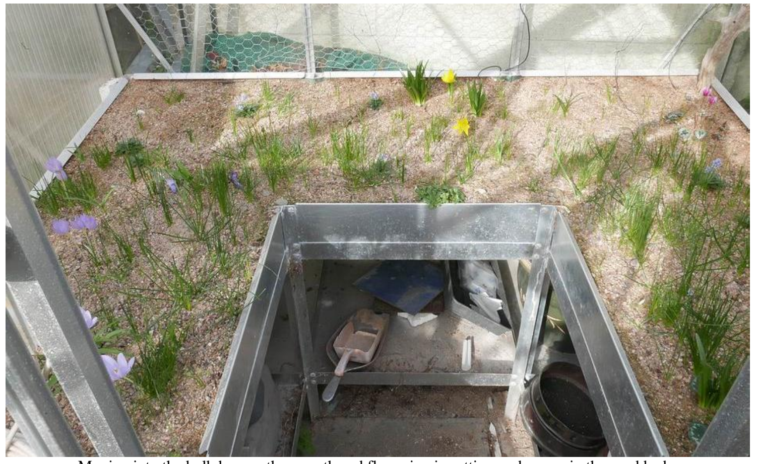
Moving into the bulb houses the growth and flowering is getting under way in the sand beds.