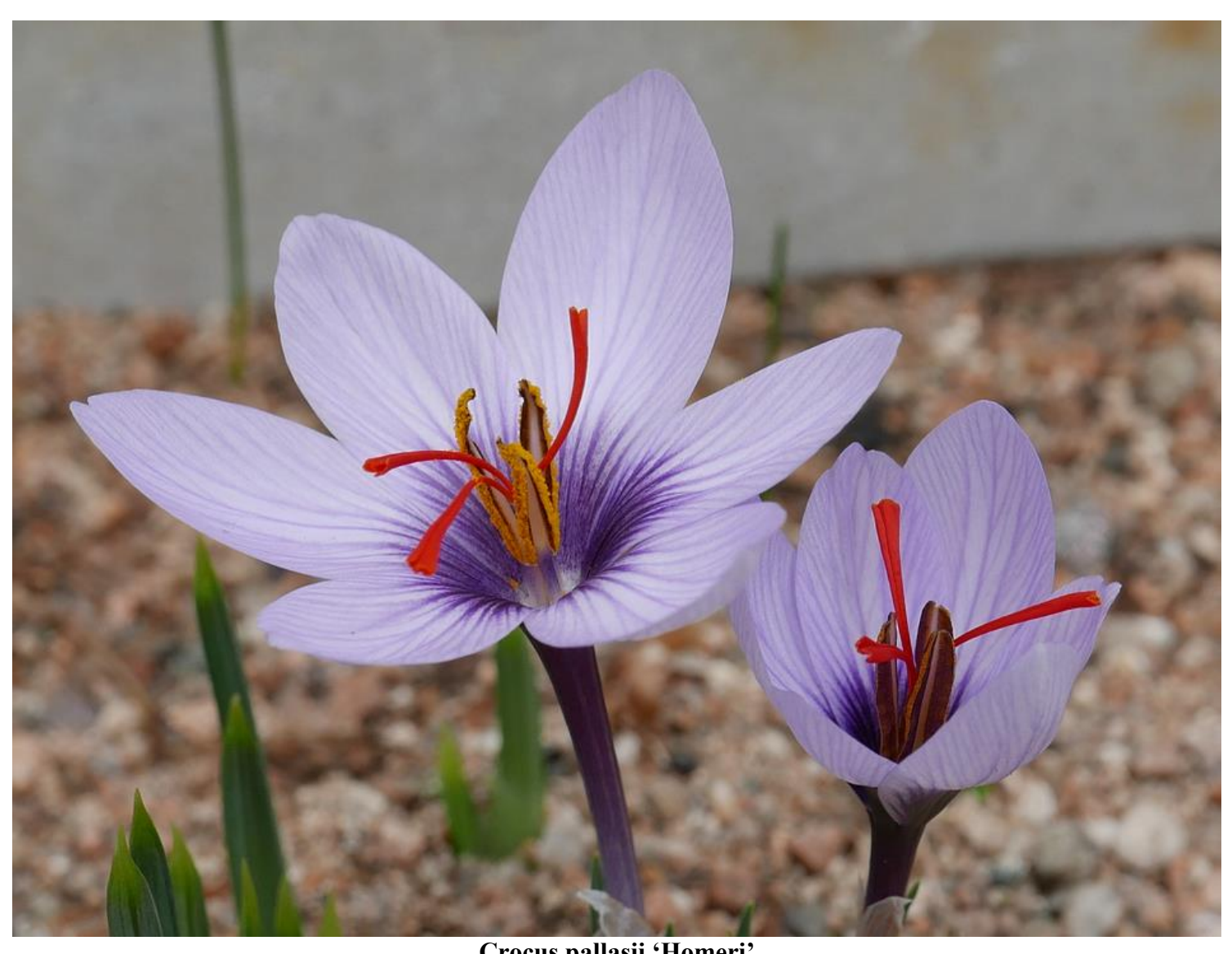
Crocus pallasii 'Homeri'

Crocus mathewii is closely related to Crocus pallasii 'Homeri' and as this is the only one in flower just now I am cross pollinating them to see if I get a seed set.