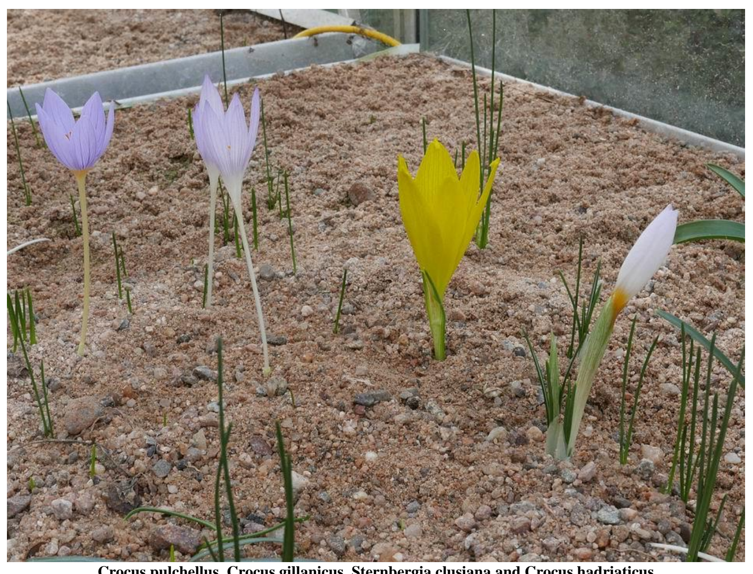
Crocus pulchellus, Crocus gillanicus, Sternbergia clusiana and Crocus hadriaticus