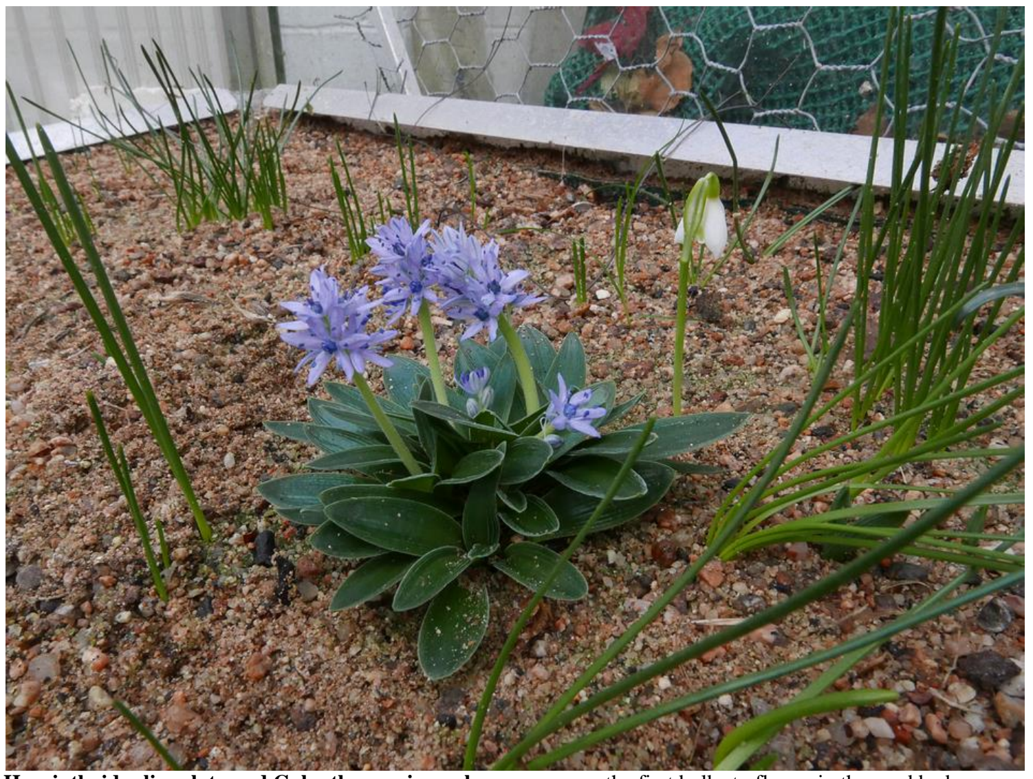
Hyacinthoides lingulata and Galanthus reginae-olgae are among the first bulbs to flower in the sand beds starting a season that will give us flowers all through the winter, the spring and into early summer.